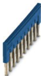
Plug-in bridge, Number of positions: 10, Color: blue

Please be informed that the data shown in this PDF Document is generated from our Online Catalog. Please find the complete data in the user's documentation. Our General Terms of Use for Downloads are valid ( http://phoenixcontact.com/download )