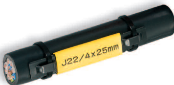
PO-068TW for cable marking on SMOH