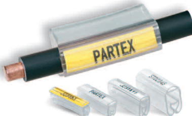
PP profile inside PT+ sleeves