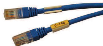
PP profile inside PTC sleeve