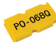
PO-068Q profile for cable marking