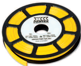
Compactdisc with PO profiles