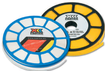
PP profile on compactdisc