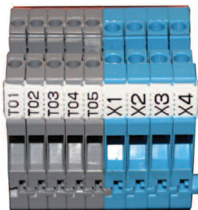
PP profiles mounted on terminal block