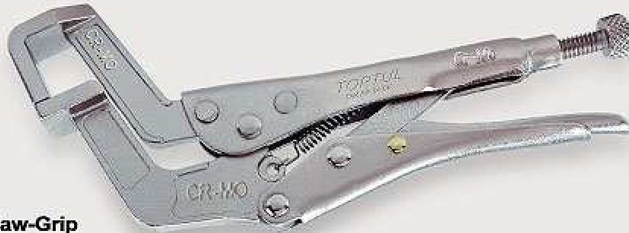
► Deep Throat Claw-Grip Locking Pliers DMAF1A06