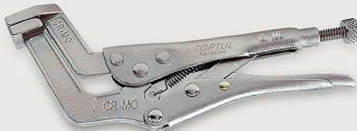
► Claw-Grip Locking Pliers DMAE1A06