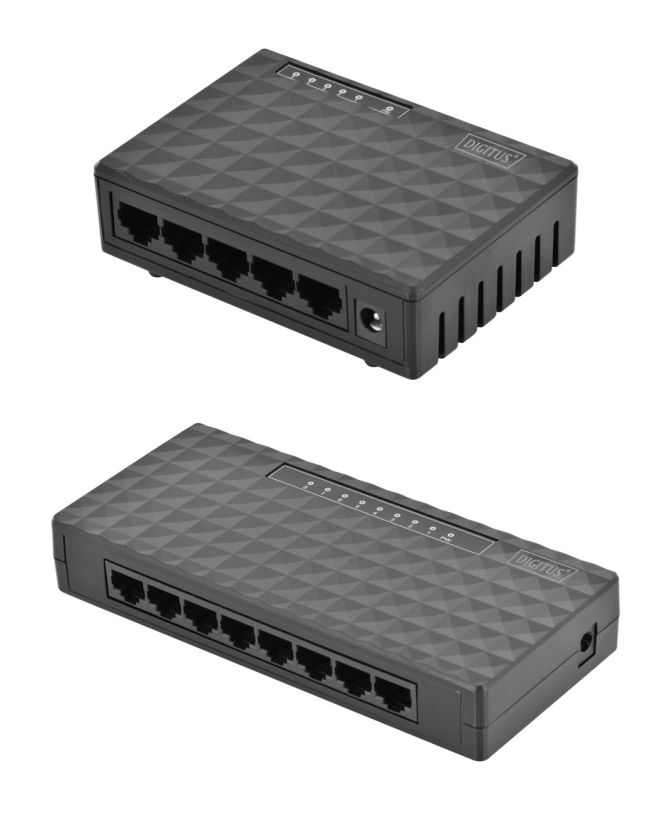
User Manual DN-80063 • DN-80064