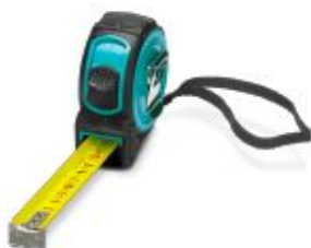
Tape measure, 5 m

Please be informed that the data shown in this PDF Document is generated from our Online Catalog. Please find the complete data in the user's documentation. Our General Terms of Use for Downloads are valid ( http://phoenixcontact.com/download )