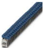
Connection terminal block, Connection method Screw connection, Load current : 76 A, Cross section: 1.5 mm 2 - 16 mm 2 , Width: 9.8 mm, Color: blue

Connection terminal block - AKG 16 BU - 0423014