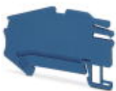
Support bracket, Bracket for busbars, set every 20 cm, Length: 67 mm, Width: 2 mm, Height: 43 mm, Color: blue

Connection terminal block - AKG 16 BU - 0423014