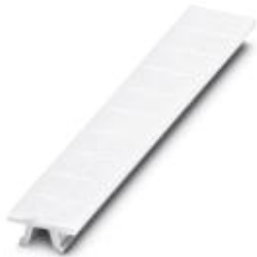
Zack marker strip, 10-section, horizontally labeled with the consecutive numbers: 91 ... 100, white, width: 6 mm

Please be informed that the data shown in this PDF Document is generated from our Online Catalog. Please find the complete data in the user's documentation. Our General Terms of Use for Downloads are valid ( http://phoenixcontact.com/download )