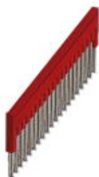
Plug-in bridge, pitch: 4.2 mm, number of positions: 20, color: red

Please be informed that the data shown in this PDF Document is generated from our Online Catalog. Please find the complete data in the user's documentation. Our General Terms of Use for Downloads are valid ( http://phoenixcontact.com/download )