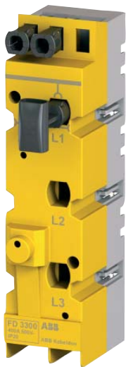
FD 3300 Disconnecter.