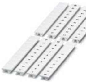
Zack marker strip, 10-section, horizontally labeled with the consecutive numbers: 1 ... 10, white, width: 8 mm

Please be informed that the data shown in this PDF Document is generated from our Online Catalog. Please find the complete data in the user's documentation. Our General Terms of Use for Downloads are valid ( http://phoenixcontact.com/download )