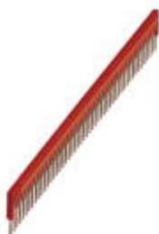
Plug-in bridge, pitch: 3.5 mm, number of positions: 50, color: red

Please be informed that the data shown in this PDF Document is generated from our Online Catalog. Please find the complete data in the user's documentation. Our General Terms of Use for Downloads are valid ( http://phoenixcontact.com/download )